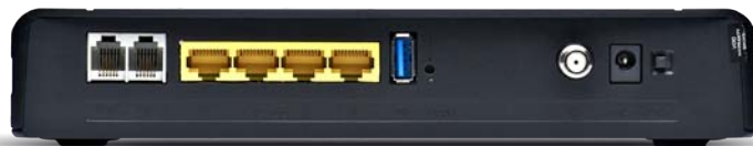
Technicolor TC7200 back panel

TECHNICOLOR WORLDWIDE HEADQUARTERS 1, rue Jeanne d'Arc 92443 Issy-les-Moulineaux France Tel: +33 (0)1 41 86 50 00 - Fax: +33 (0)1 41 86 58 59