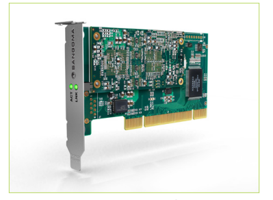
D100 PCI with low profile bracket

IP telephony applications commonly require the use of multiple voice codecs, used to digitally compress voice signals and save on bandwidth. Voice signals from the Public Switched Telephone Network (PSTN) come in the form of the G.711 codec, but the VoIP terminal equipment and networks can support a variety of different voice codecs, such as G.729, G.726, AMR, G.722, iLBC, etc. The VoIP infrastructure needs the capability to mediate between endpoints supporting different codecs, but this functionality requires digital signal processing tasks that are often costly and resource-intensive, and can affect the quality of the voice signals, if it introduces too much latency and delay.