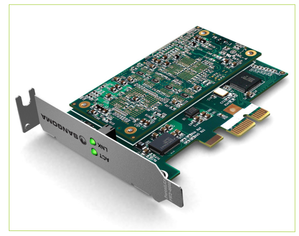
D100 PCIe with low profile bracket

The D100 works with both Asterisk® and FreeSWITCH®. With compatible drivers, these applications can use the D100 cards as seamless voice transcoding resources.