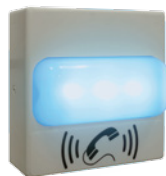
011288 Auxiliary RGB Strobe Kit