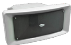
011457 SIP IP66 Outdoor Horn