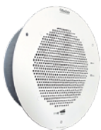
011393/011394 SIP Speaker