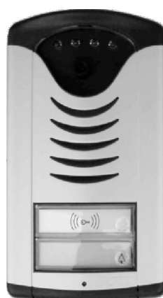
REM 57U reader in IPDP Slim entry panel